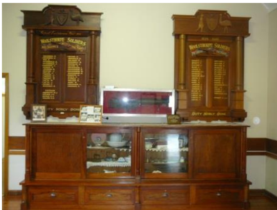
The Historical Society's display

Some of those enjoying the new air-con are the Woolsthorpe Historical Society, who also has a permanent display in the hall, the Woolsthorpe Country Women's and Progress Associations whom regularly meet at the hall.