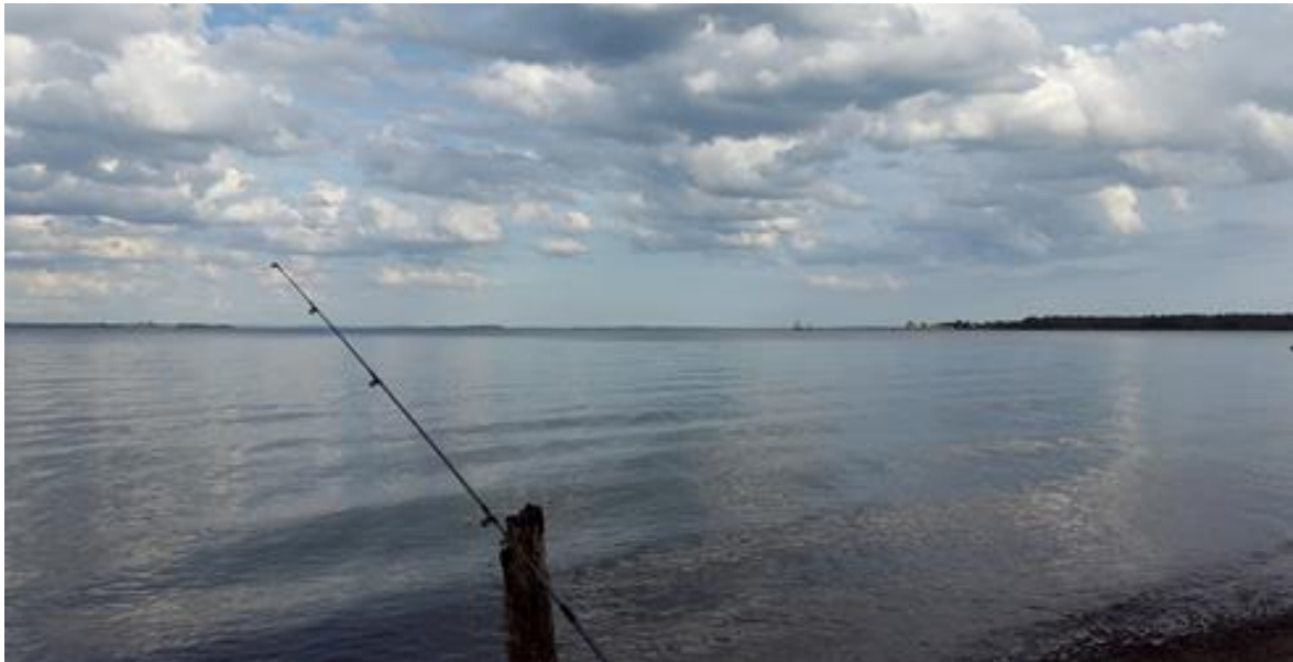
Wooleys South Beach