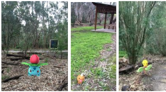
More Pokémon

The committee hopes the photos will encourage more visitors through the reserve to appreciate the fantastic revegetation work that the committee has undertaken and is rightly proud of.