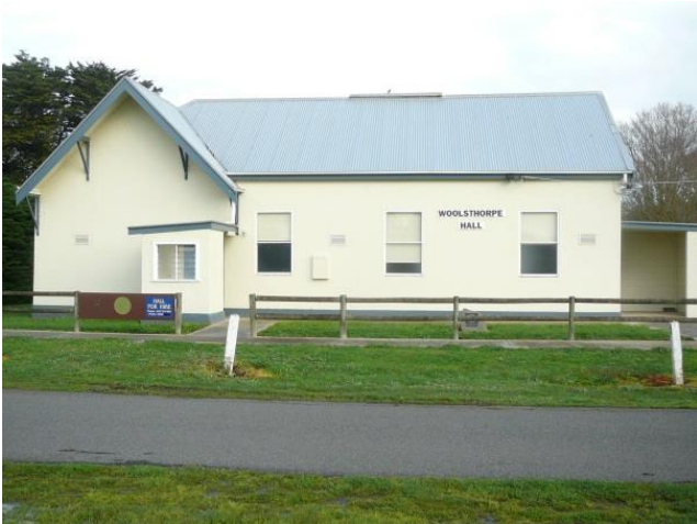
The Hall

The committee secured a grant through the Moyne Shire Council for a split-system air conditioner to provide a measure of comfort to attendees.