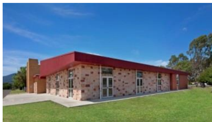
Sterling Place

The new Dunkeld Community Centre, named Sterling Place, was officially opened on Sunday 29 May 2015.