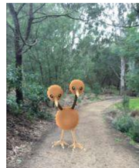
A Doduo on the trail

They were first told of the Pokémon in the reserve by the Chairperson's daughter. Rare Pokémon have been found and there is even a Poké stop where players can stock up on the Poké balls needed to play.