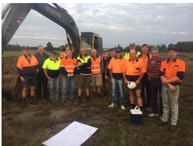
Hi Vis galore

A week after the pond was completed it was tested with some heavy rain. The pond filled up and is working perfectly!