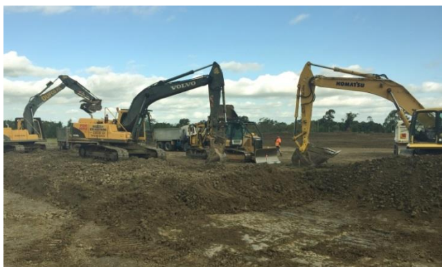
Machinery in action

The grant money was used to provide diesel to contractors who in turn provided excavators, trucks and bulldozers at no cost to the committee.