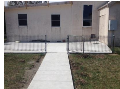
Watch this space

The Winslow Mechanics Institute committee developed a prioritised works plan and, with the help of WestVic Staffing Solutions & Western District Employment Access, turned this into a Work for the Dole activity proposal. The works include painting inside and out, replacing doors and guttering, replacing a path and developing a barbeque area.